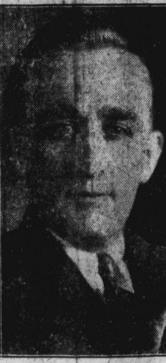
Joseph C. O'Mahoney (above), first assistant postmaster general, will be appointed to succeed the late Senator John B. Kendrick of Wyoming.