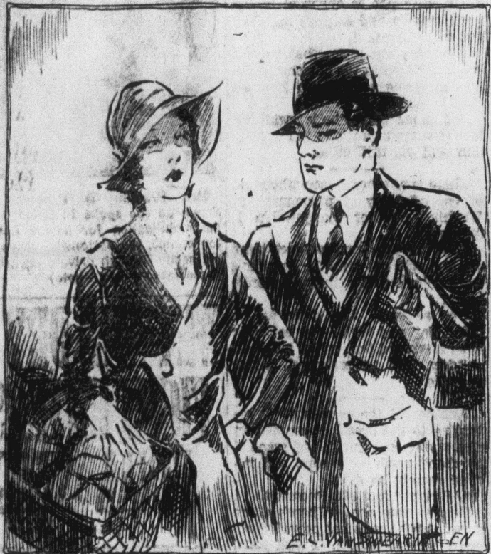
"Nesta must have known her own husband!"

"I hoped it was you, and that you were making it up."