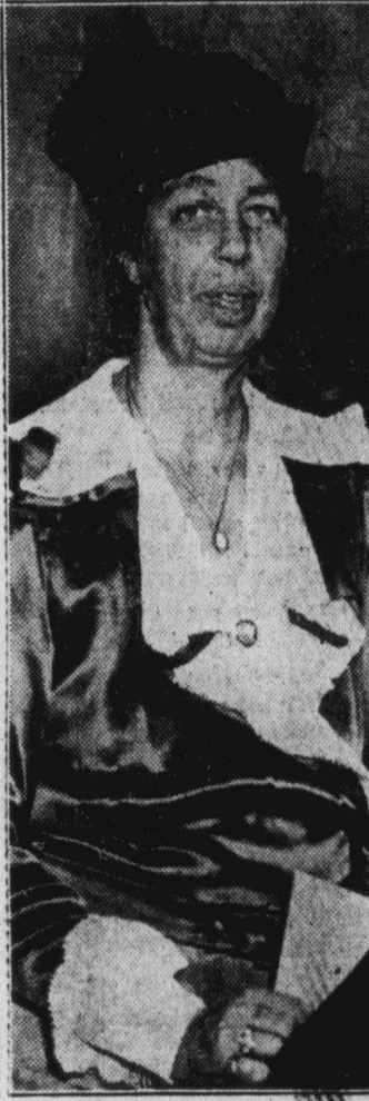
Mrs. Franklin D. Roosevelt is shown as she spoke in Chicago at the mobilization for human needs conference, the nationwide drive to aid needy through private agencies.