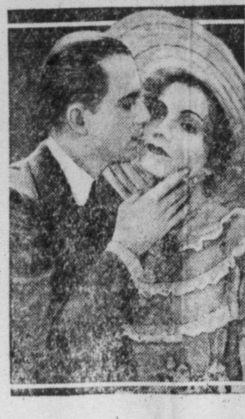
Incomparable Lee Tracy with Male Clarke who are at the State Wednesday in "Turn Back the Clock," clever comedy.