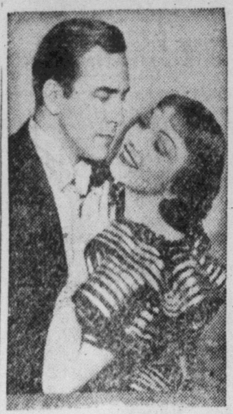
Through playing "goody-goody" roles, Claudette Colbert again steps forth in a siren-like character portrayal in "Torch Singer" which opens Monday at the State Theatre. Here she is seen with David Manners in one of the scenes.