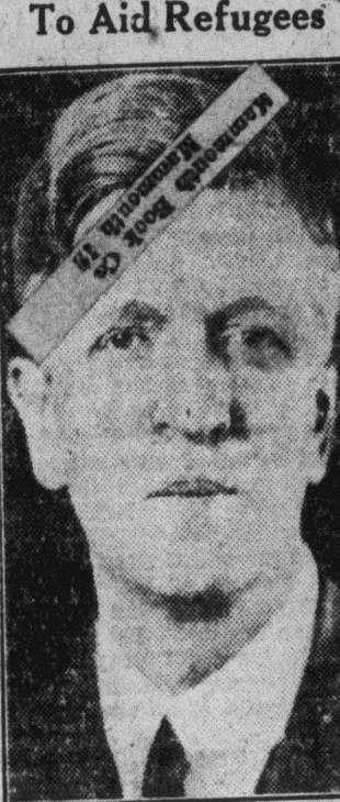
James G. McDonald of New York was appointed by the League of Nations as high commissioner of Jewish refugees from Germany.

Szeged, Hungary.—(AP)—Mostly small merchants and farmers, 55 out of 59 persons tried here for formation of a communist "cell," were sentenced to genuine cells for terms ranging up to three years.