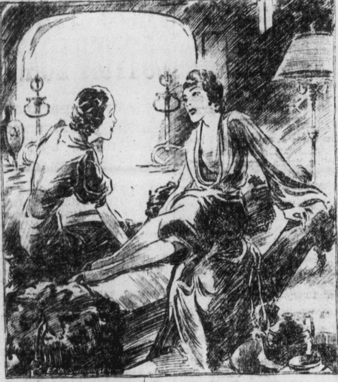
What could Caroline say to such unhappiness?

AS Caroline followed a tall young footman up the imposing staircase of Packham Hall, she looked about her with interest. She had not been in the house since she was a little girl. The footman handed her over to Mrs. Van Berg's maid. Caroline came back to the present with a jerk and took a good look at the "intending" woman. She saw a middle-sized person of very discreet appearance with a manner, nicely attuned to what might at any moment become a house of mourning. As they turned into a long corridor, one of Elmer Van Berg's nurses passed them, going in the direction of the stairs, a pretty, rather hard-featured girl with bright blue eyes.