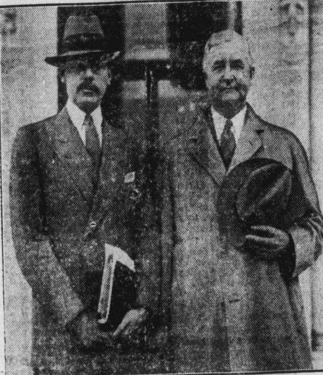
Dean Acheson (left), undersecretary of the treasury, and Jesse Jones, chairman of the Reconstruction Finance corporation, are shown leaving the White House after a discussion with President Roosevelt of his plan for establishing a government market for gold newly-mined in the United States.