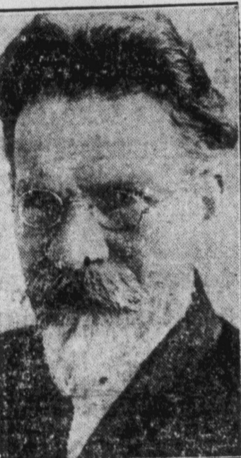
Mikhail Kalinin, president of the Soviet central executive committee, responded favorably to President Roosevelt's proposal that the United States and Russia end their present "abnormal relations."