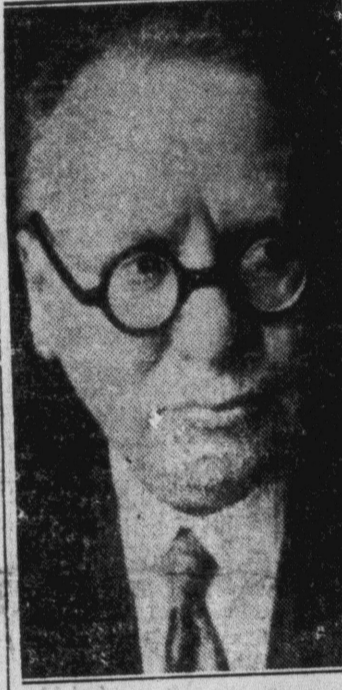
Maxim Litvinoff, commissar for foreign affairs of the Soviet government, will come to Washington soon to confer with President Roosevelt regarding recognition of the Soviet republic by the United States.