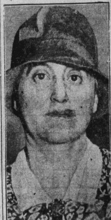
Mrs. Rosika Schwimmer (above), pacifist, filed a $100,000 damage suit in New York supreme court against William Fox and Upton Sinclair, charging a passage in one of Sinclair's books portrayed her as an "arch-hypocrite" by indicating that she broached the wartime "peace ship" idea to Fox as a publicity venture and later presented the same plan to Henry Ford.