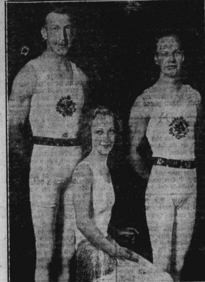
Above is a picture of the All-American Fliers who will be seen at the Pitt County Fair which opened at the Fair Grounds here last night. The Fair will continue during the remainder of the week.

"charmed circle" with a mark of 302 for 137 games.