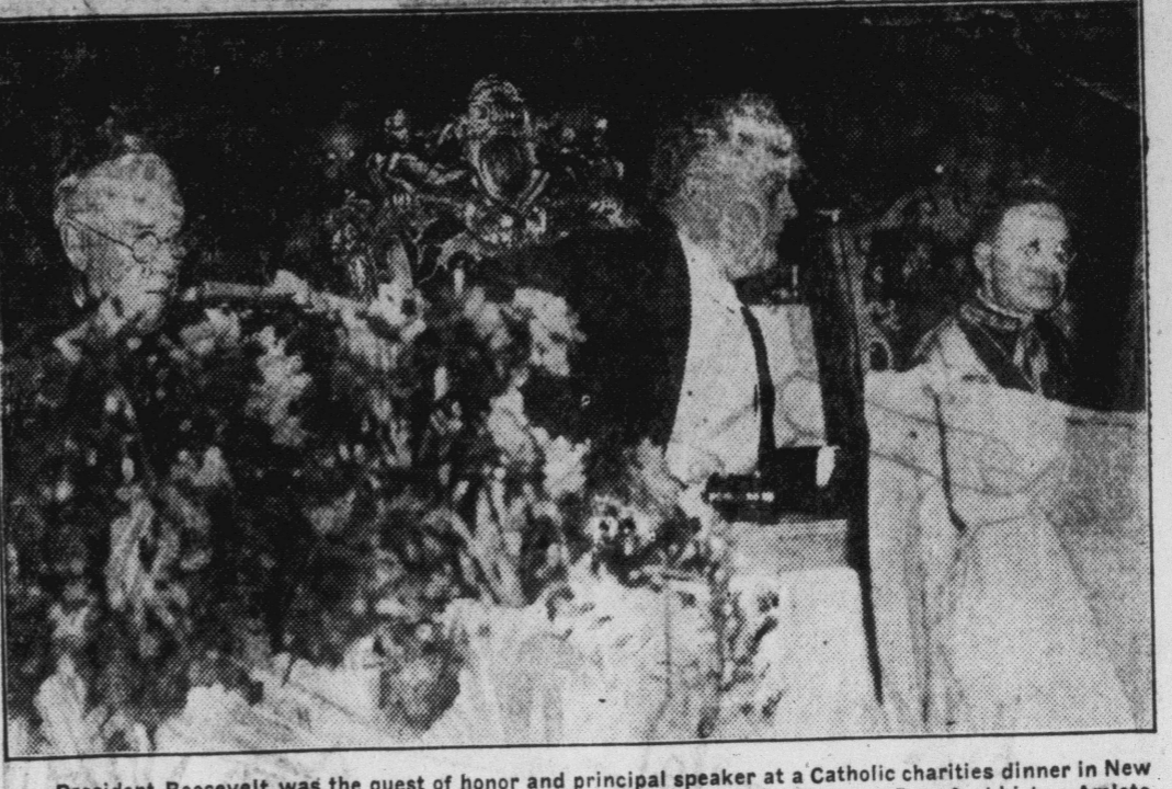
President Roosevelt was the guest of honor and principal speaker at a Catholic charities dinner in New York. He is shown at the speakers' table with Cardinal Hayes (left) and the Most Rev. Archbishop Amleto Giovanni Cicognani, the apostolic delegate and representative of Pope Pius XI.

Sabbath School at Ballard's Cross Roads at 3:00 p. m. 6:30 p. m.—Young People's Societies will meet in the church. 7:30 p. m.—Evening worship. Sermon: "Loving Honesty."