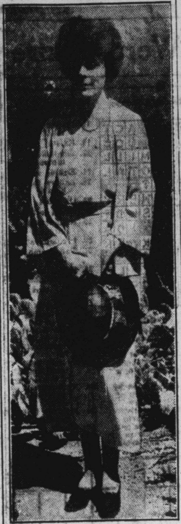
Mrs. Isabella Greenway of Tucson, Ariz., a friend of President Roosevelt, was elected to the house of representatives to fill the vacancy caused by appointment of Lewis Douglas as budget director.