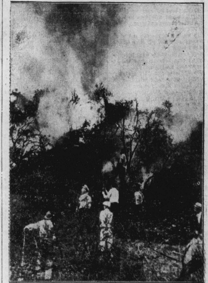
Fire fighters are shown battling a brush fire that turned a canyon in Griffith park, Los Angeles, into a raging inferno. At least 27 men who were trapped in the canyon burned to death.