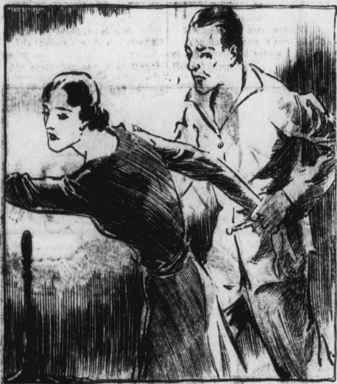
Next moment he had her by the wrists.

HE shook his head. "No—it's gone." She looked at him curiously. "You don't know where you lived or what you did before I met you? Honest Injun?"