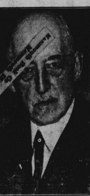
R. Walton Moore, former representative from Virginia, was appointed assistant secretary of state to succeed Raymond Moley.