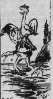
Tomorrow—"The Mighty Rock"

By MARY GRAHAM BONNER Willy Nilly had to use several poles before he succeeded in getting the shed back up the pond. It was so hard to steer and it was exhausting work. At last they reached the part of the pond which as a rule led up a path and thence on to a road that was on the way to Willy Nilly's. But now everything was covered with water and it reached up to Willy Nilly's waist. The Ducks decided they would stay in the pond and get something to eat so the others made their way up to Willy Nilly's. Top Notch perched on Willy Nilly's right shoulder, Christopher Columbus Crow flew, and Rip swam until they reached the house. They found its foundations had almost given way but not quite; but before planning how to get everything in order once more they all sat down and had an enormous meal. "I wonder how Jelly Bear and Honey Bear have been getting along all this time," said Willy Nilly. "It was a good thing they did not go along with us." "Yes, having so much to eat makes me think of them, too," said Top Notch. "I suppose it will be a week or so before I can get my shed back to the place where it belongs. You'll help me, won't you, Willy Nilly?" "Well all have to work hard after a food like this, but we can be thankful we weren't washed over the dam. Now I must go to the cave." When he reached there a sight greeted him that made him feel stunned.