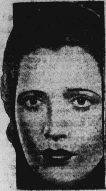
Kay Francis who is featured as a woman physician in the highly interesting story "Mary Stevens M. D.," at the State Thursday.