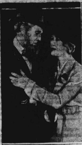
Lionel Barrymore and Miriam Hopkins, together in "The Stranger's Return," State Friday. Story written by author of "State Fair."