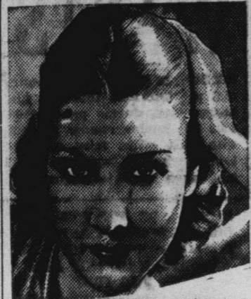
Jean Parker featured in "What Price Innocence?"