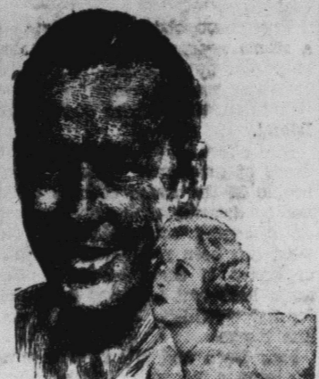
Above—James Dunn and Joan Bennett who co-star in the romance "Arizona To Broadway." Left—Barbara Stanwyck and Geo. Brent together in drama, "Baby Face."