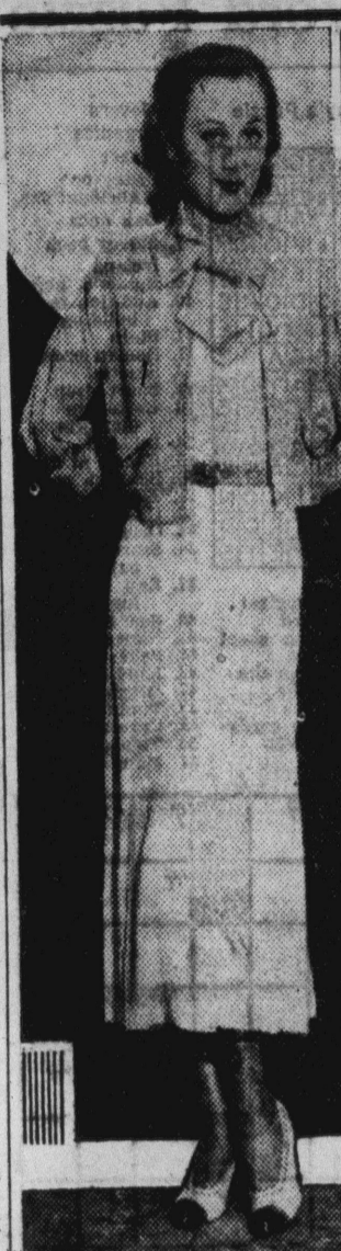
A dainty pink Jacquette featuring a smart collar and tie is worn by Ann Dvorak of the films with her white serge sports frock.