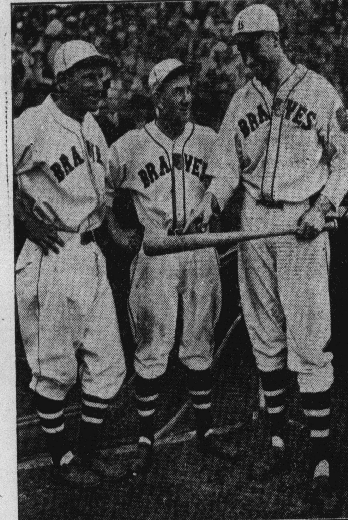
Wally Berger, heavy hitter of the Boston Braves, exhibits his war club to his team mates Pinky Whitney (left) and Rabbit Maranville (center) just before Boston and the New York Giants opened their "crucial series" in Boston. A little later Berger stepped up to the plate and poled out a home run, helping the Braves defeat the Giants 7 to 3.

of jobs in 1934. But it is well to remember that the first outings for a shake-up in any ball club are always the loudest.