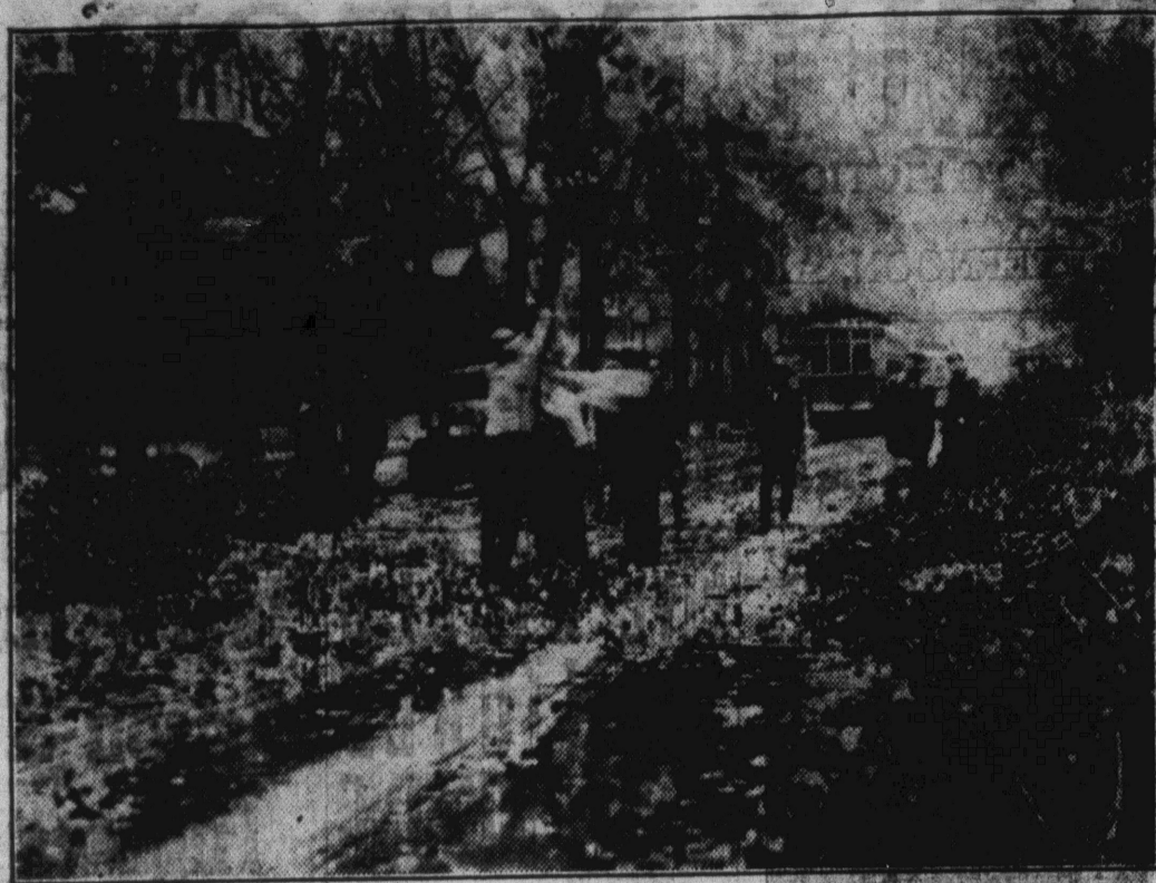
The storm that battered the Atlantic seaboard ripped through Baltimore at a 50-mile pace uprooting trees, tearing off branches and crippling traffic. This picture shows a street littered with branches and wreckage, men attempting to clear the way for traffic.