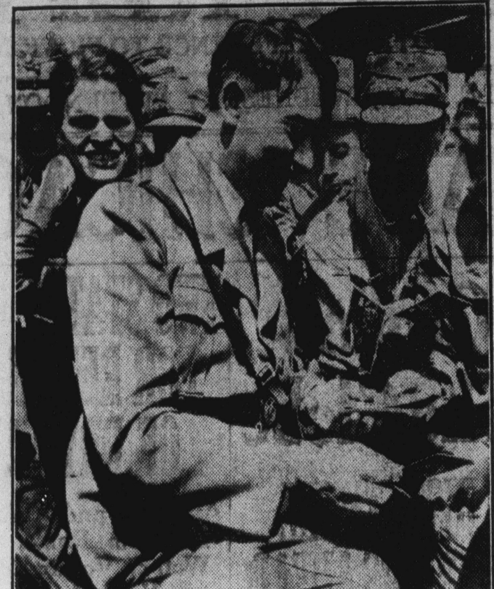
Adolf Hitler, German chancellor, was besieged by autograph hunters when he attended a meeting of Nazi leaders at Herran-Chiemsee, Bavaria. He is shown here obliging a group of admirers.