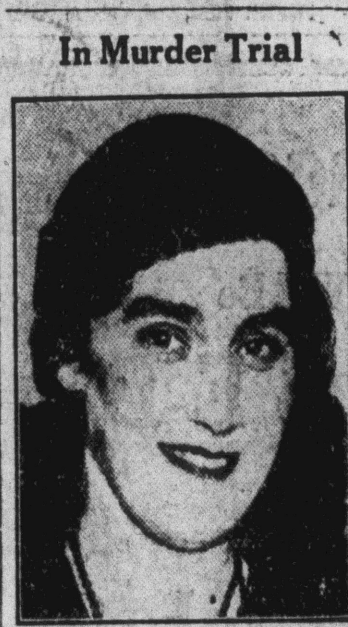
In Murder Trial