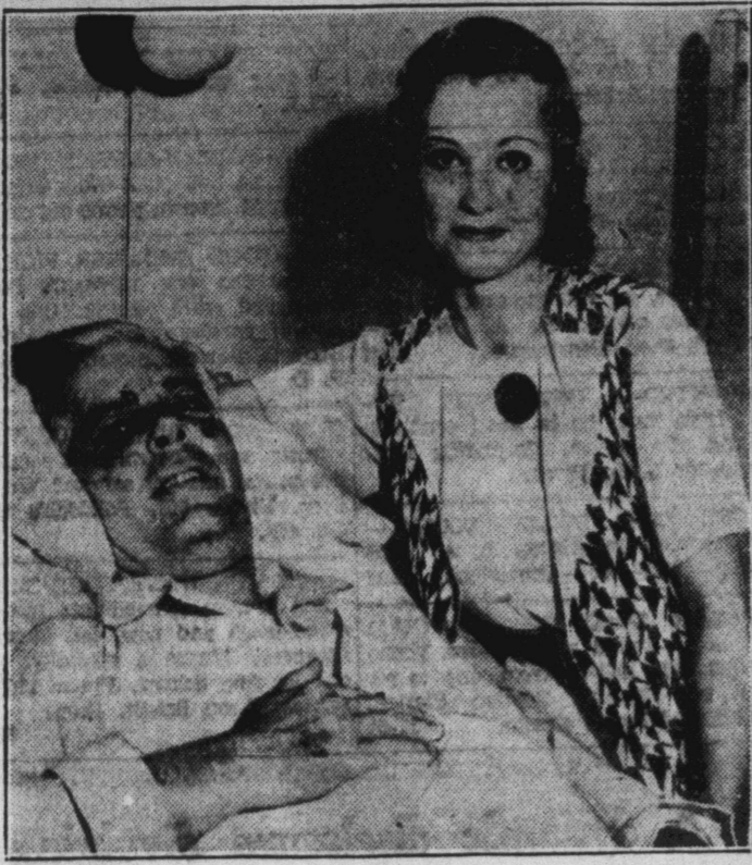
Hoot Gibson, movie cowboy recovering from injuries received in an airplane crash-up, and June Gale, 21-year-old film actress, agreed they were "madly in love." At the same time Gibson announced he and his wife, Sally Eilers, plan to be divorced.