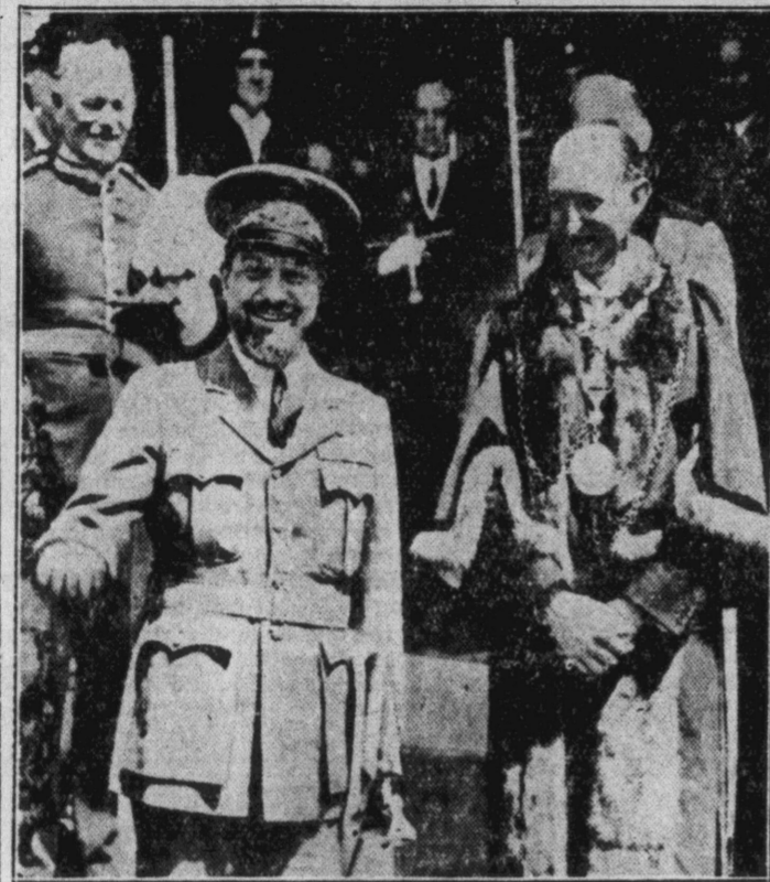
Gen. Italo Balbo, leader of the Italian air squadron flying to Chicago, is shown happily responding to an enthusiastic welcome given the birdmen by the mayor and civic dignitaries of Londonderry, Ireland.