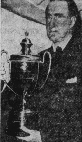
Frank J. Marshall, United States chess champion, is shown with the F. G. Hamilton Russell trophy which an American team he captained won in international competition at Folkestone, England.