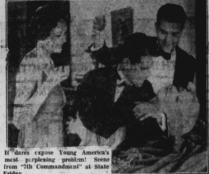
It dares expose Young America's most perplexing problem! Scene from "7th Commandment" at State Friday.

ran a patisserie on the edge of Paris. The boy worked like a galley slave for two years in the bakery basement; the story of those two years makes up a good half of the book, and is one of the most interesting and pathetic that has come to light this year.