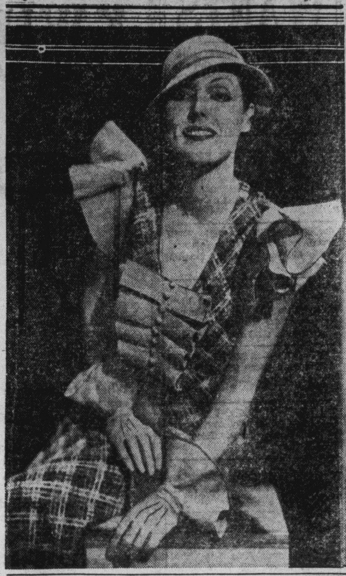
Adrienne Ames of the films introduces this new sports frock of tangerine brown and gray plaid, with jacket, belt and sleeves of gray linen.