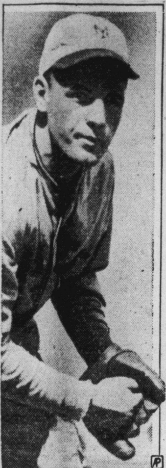
Hal Schumacher, brilliant young righthander of the Giants, will receive his degree from St. Lawrence college June 12 while his teammates applaud discreetly.

New York—(AP)—Members of the New York Giants will make a unique baseball pilgrimage June 12, when they travel to St. Lawrence university at Canton, N. Y., to see their teammate, Hal Schumacher, receive his shepkin.