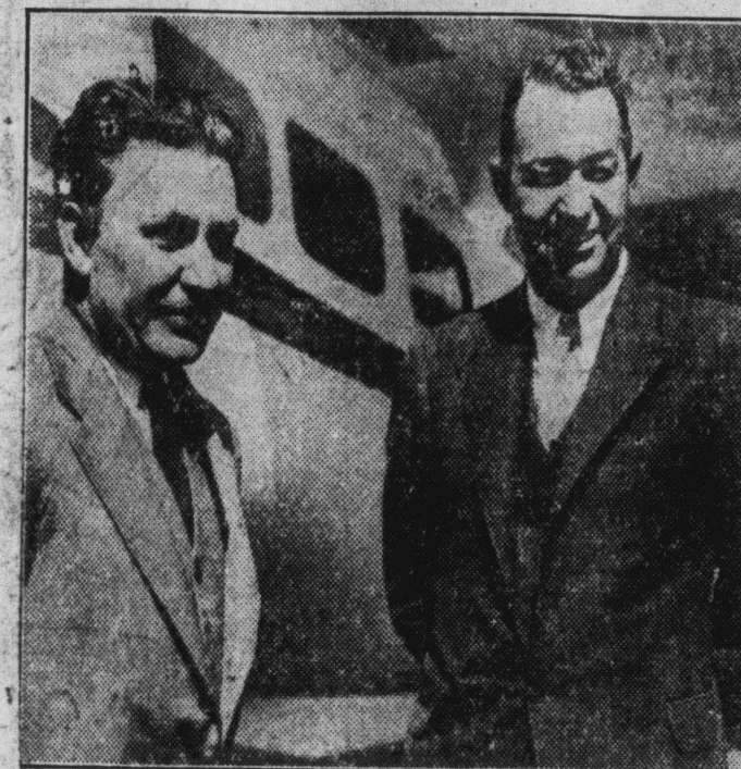
Wiley Post (left), co-holder of the world flight record, is making preparations for a solo flight around the world. He will use a robot pilot to permit him to rest and navigate during the flight.