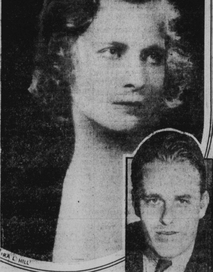
It was disclosed in Los Angeles that Elliott Roosevelt, son of the President, and his wife, the former Elizabeth Donner, would seek a Nevada divorce. The divorce will be sought on the grounds of incompatibility. The announcement followed the short visit of Mrs. Franklin D. Roosevelt with her son on the coast.