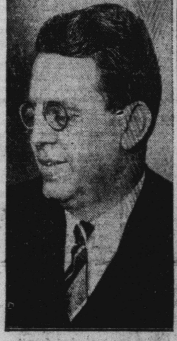
Chester P. Mills, former New York district dry chief and winner in 1928 of a $25,000 prize for "the best plan to enforce prohibition," was named with eight others in a federal indictment charging conspiracy to violate the prohibition laws.