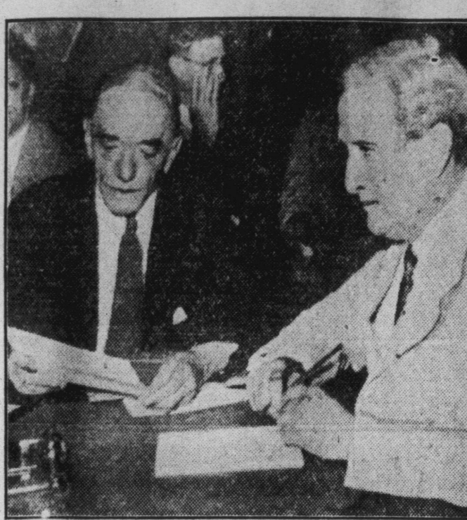
Louis M. Howe (left), secretary to President Roosevelt, testified before the senate military committee regarding the purchase of toilet kits for conservation camp workers. The committee is investigating charges that the kits, bought at $1.40 each, could be duplicated for from 75 cents to 85 cents. Howe is shown with Senator Morris Sheppard, chairman of the committee.