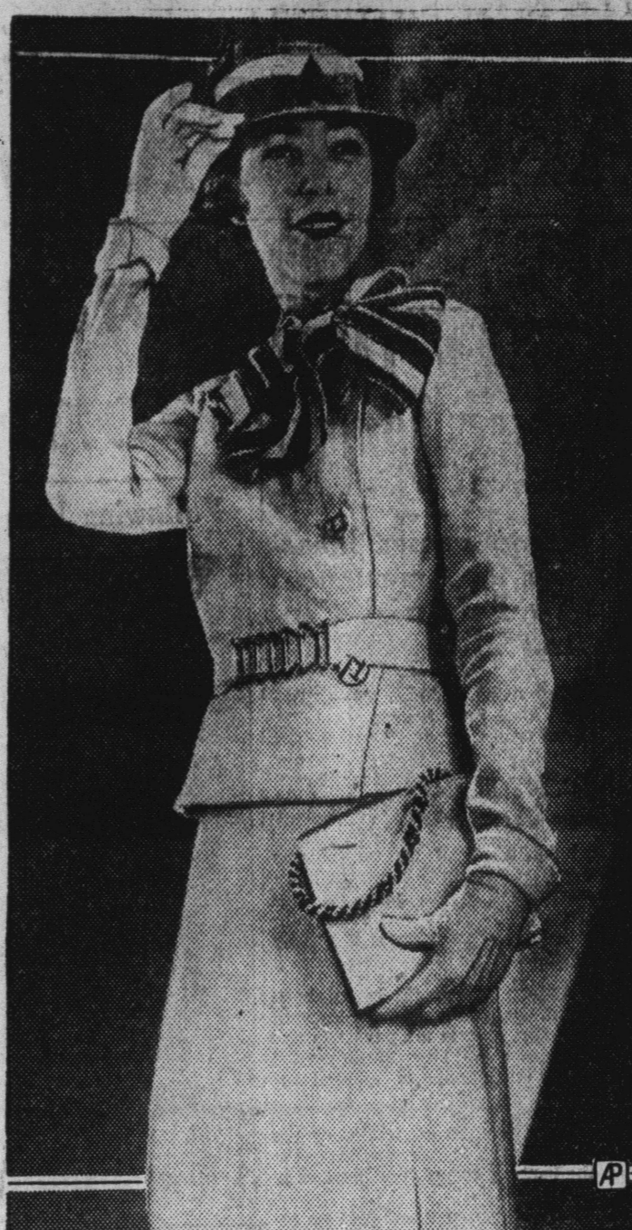
This summer suit of crisp white linen by Worth is accented with a scarf of red, black and white crinkled ribbon. Buttons are white crystal and belt links are barred with red and black. The black milan sailor hat is accented by a red and white band.

Paris—(AP)—"Say it with a suit" is one fashion rule for summer smartness. For hot days in town or cool days in the country dressmakers offer scores of tailored models designed to retain their freshness no matter what the weather.