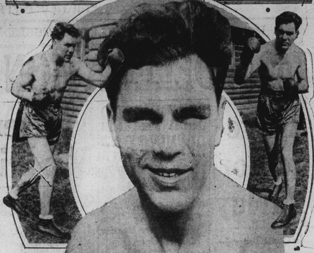
Here are three camera studies of Max Schmeling, former heavyweight champion, who meets the rugged Californian, Max Baer, in a 15-round battle in New York the night of June 8.