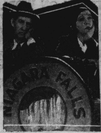
SLIM SUMMERVILLE and ZASU PITTS "OUT ALL NIGHT" State-Friday

MAKES APPEAL TO MAIL MEN (Continued From page one) enjoyed a delightful luncheon which