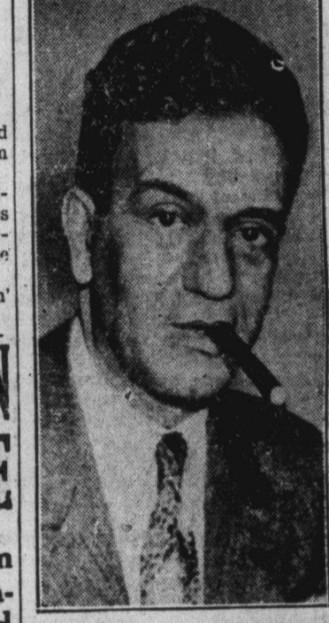
This is a new camera study of Ferdinand Pecora, inquisitor of J. P. Morgan as counsel for the senate committee investigating banking practices, who said his critics were welcome to search for flaws in his work-and announced that "other notables" were due for scrutiny.