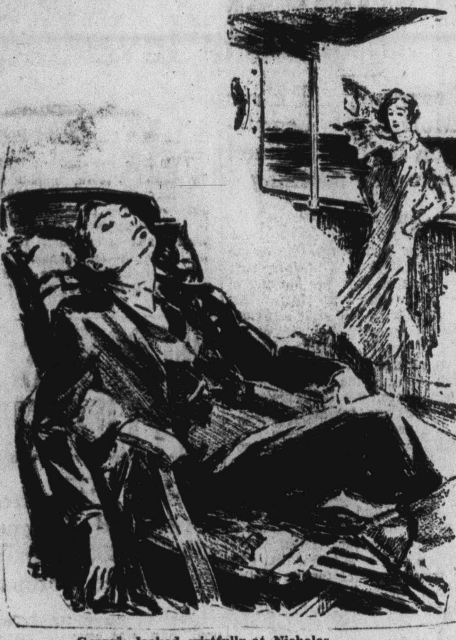
Georgie looked wistfully at Nicholas.

"How awful! A real fallen star, isn't he? I'd rather be dead. No wonder he keeps out of everyone's way. I shouldn't be surprised if he doesn't jump overboard before we get to Southampton."