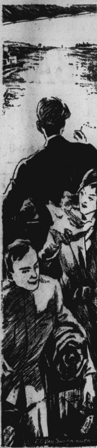
He stared out over the water.

He made no offer to take them, and she laid them down on the little table between them.