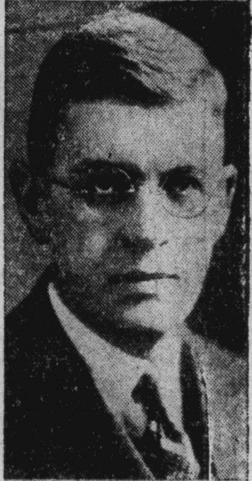
Dr. Harold Willis Dodds is expected to be appointed the fifteenth president of Princeton university.