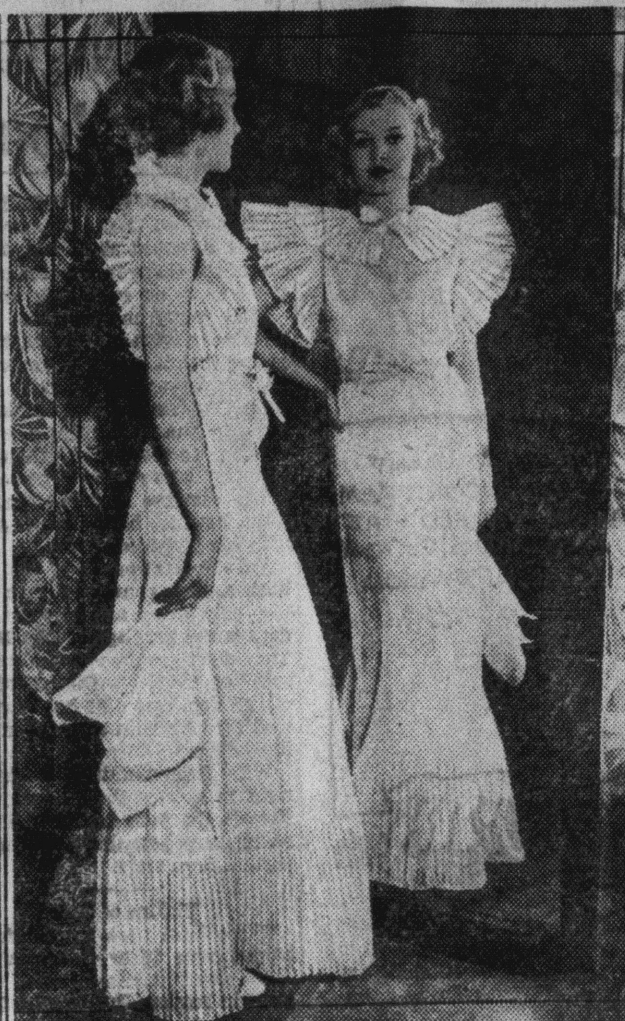
"As you desire me" is the name of this summer dance frock of white organdie. It has pleated ruffles and a plaid sash.