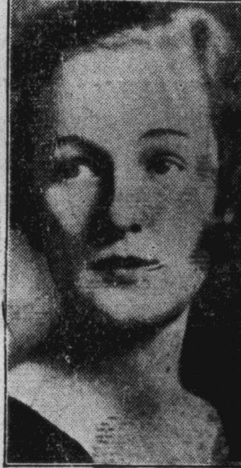
Girl students at Wellesley college in Massachusetts each year choose the most beautiful member of the senior class to preside over annual tree planting ceremonies.