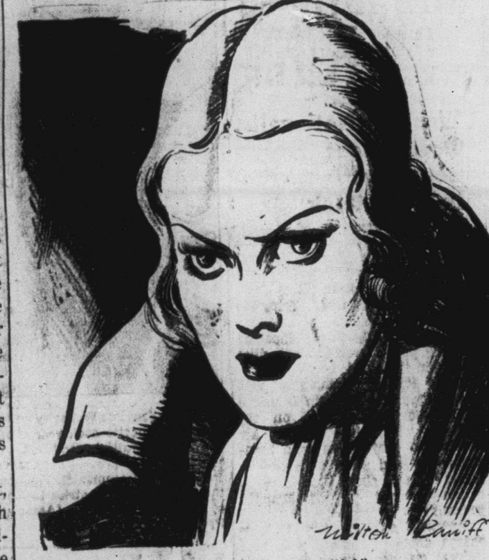
"We both know that Sue's wilful."

Lorn did not even look at me to see what I thought of his warning, if warning it was. He continued at once. "Mr. Tally doesn't seem to want me. I'll just go take a look at this very opportunely robbed safe." "Wait," I said quickly. "I've got the link between Stravsky and Lovschien." "What?" This time I did succeed in getting his full attention. "One that will hold water with the police?" "Well—perhaps not," I said, and thereby lost at least three-fourths of his interest. "What then?" he inquired with an effect of languor.