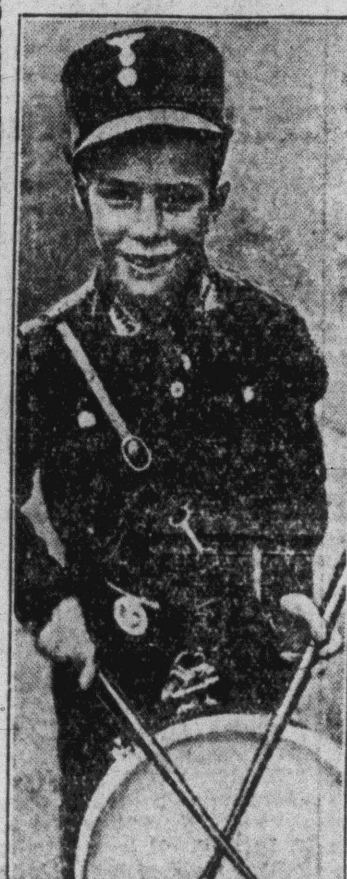
Here's one of Adolf Hitler's youthful admirers demonstrating his enthusiasm for pouncing a drum with all his might...