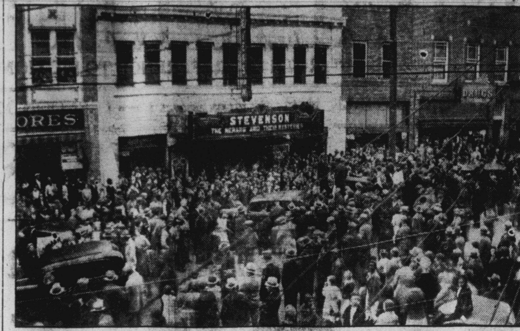
That the famous Nemars, who will give an exhibition here next Friday under the auspices of The Reflector, draw crowds wherever they go is evidenced by the above photograph taken recently in Henderson on the occasion of the Nemar drive in that city.

only a faint notion. Don't bank in it. Don't hope for anything. I mean it. I'm counting on Lorn and Lorn only. Unless the Paris detectives get here first."