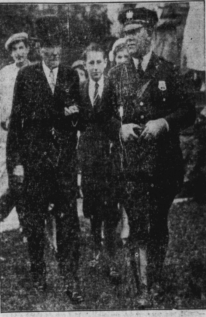
John D. Rockefeller, Sr. is shown surrounded by state troopers and youthful admirers at Lakewood, N. J., when he attended church services. It was his first public appearance since his recent return from his winter home in Florida.