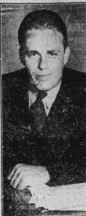
Elliott Roosevelt, 22, second son of the President, shown at his desk in Los Angeles where he has taken a position as general manager of the Gilpin air lines operating between Los Angeles and Agua Caliente, Mexico.