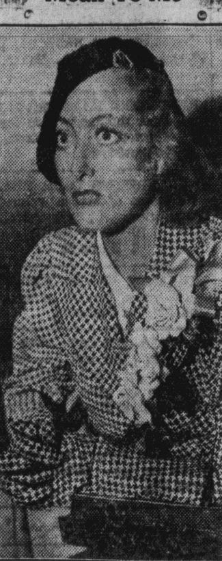
Joan Crawford, movie star, is shown on the witness stand in Los Angeles court where she was awarded divorce from Douglas Fairbanks, Jr. She charged mental cruelty.

alize that in order to be a success in the line of money and the things which money buys he must be able to think well.