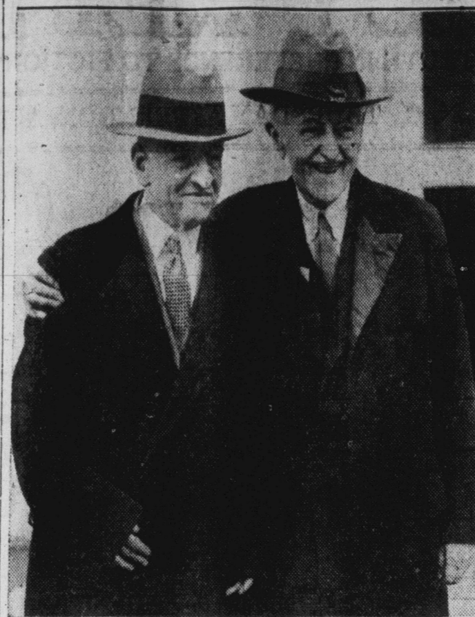
Taking the lead in the formation of permanent banking legislation, President Roosevelt expounded his views to Senator Carter Glass, at a White House conference in which Secretary Woodin participated. Glass (left) and Woodin are shown leaving the White House after the parley.