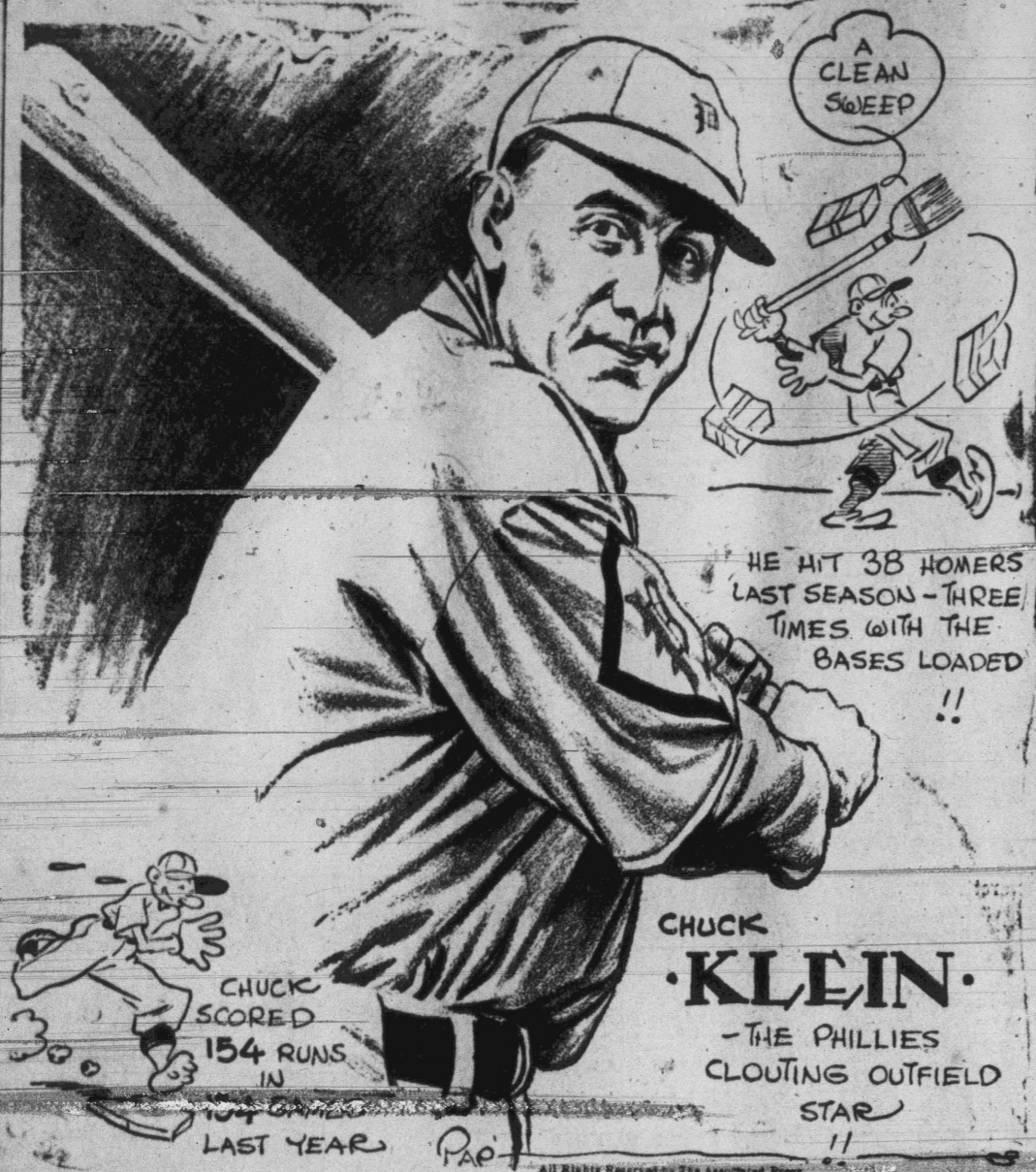
CHUCK KLEIN - THE PHILLIES CLOUTING OUTFIELD STAR