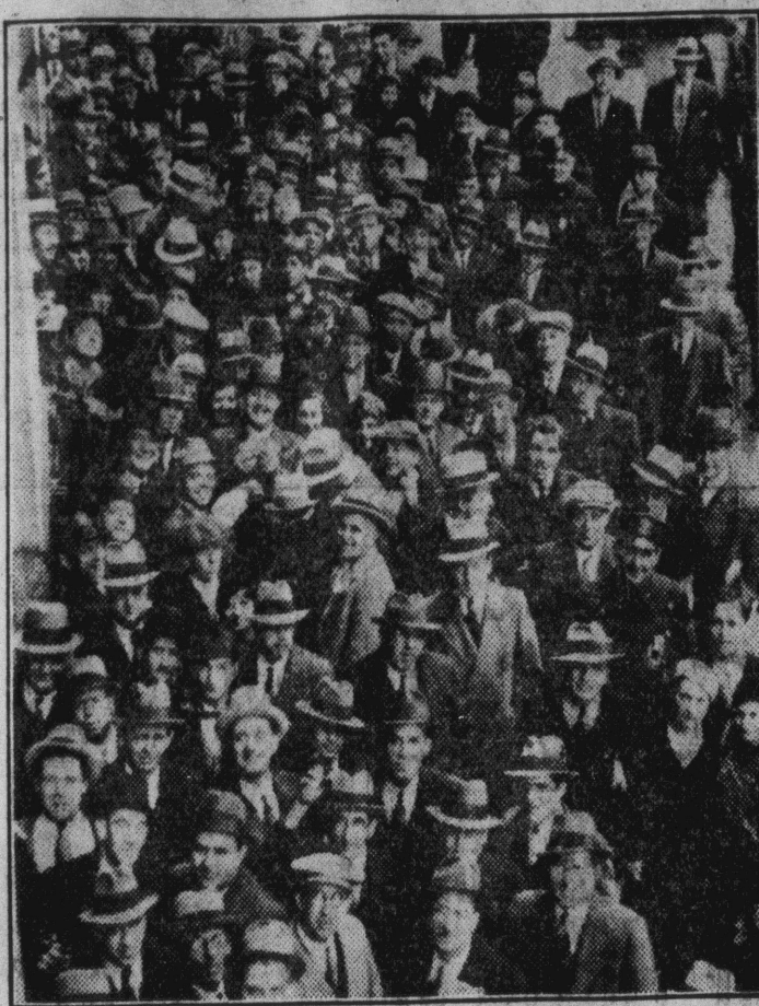
Were New Yorkers anxious to dispense the newly legalized beer or not? This picture is the answer. It shows scores of manufacturers, wholesalers and retailers jammed in front of the entrance to the city board of health seeking beer licenses.

introducing Peggy Hopkins Joyce to talkies.