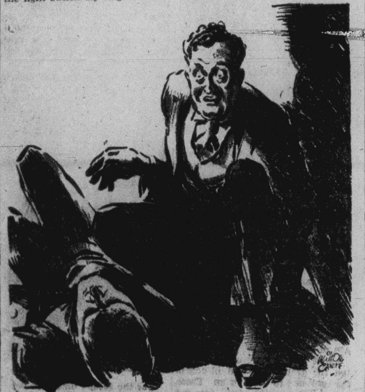
Lovschlem fell on his knees and stared.

"The police. But the police—I am ruined! I am ruined! There's no need to call the police. I can't have