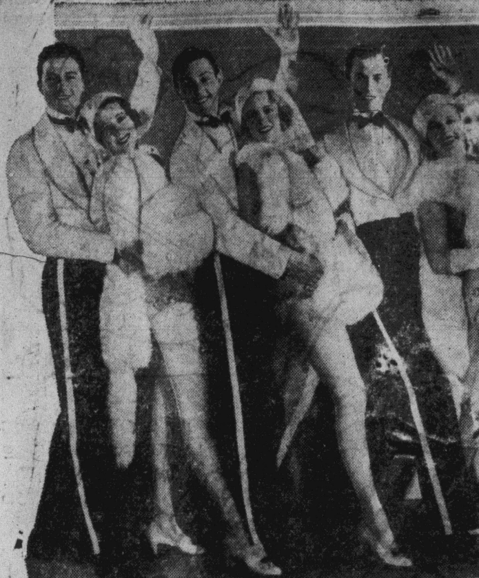
"42nd Street" says "Hello." Scene from screen's show of mirth and music opening three days engagement at State starting Monday.

On Monday, Tuesday and Wednesday nights there will be held the Twilight Services of the church. On Thursday night there will be Celebration of the Holy Communion. On Friday there will be the Good Friday Three Hour service. A cordial welcome awaits you at all the services of this church.