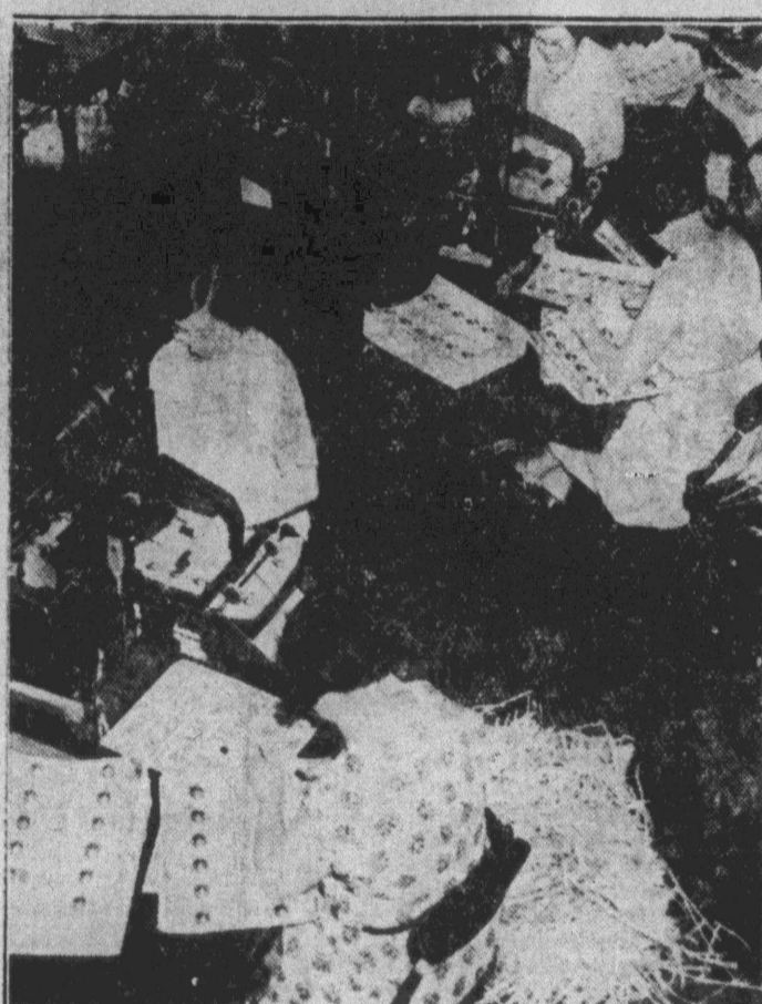
This picture, released by the secret service, gives assurance there is no depression at the bureau of printing and engraving in Washington. Women are shown trimming the edges of new currency before its issuance to the public.