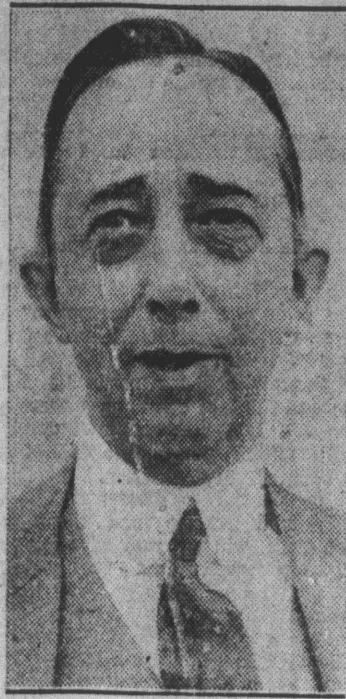
Claude G. Bowers (above) of New York, editor, author and prominent democrat, is reported to succeed Irwin B. Laughlin as ambassador to Spain.

mas tree holly, American (Ilex Opaca) is an evergreen tree strikingly handsome in any yard, and a species which should be conserved.