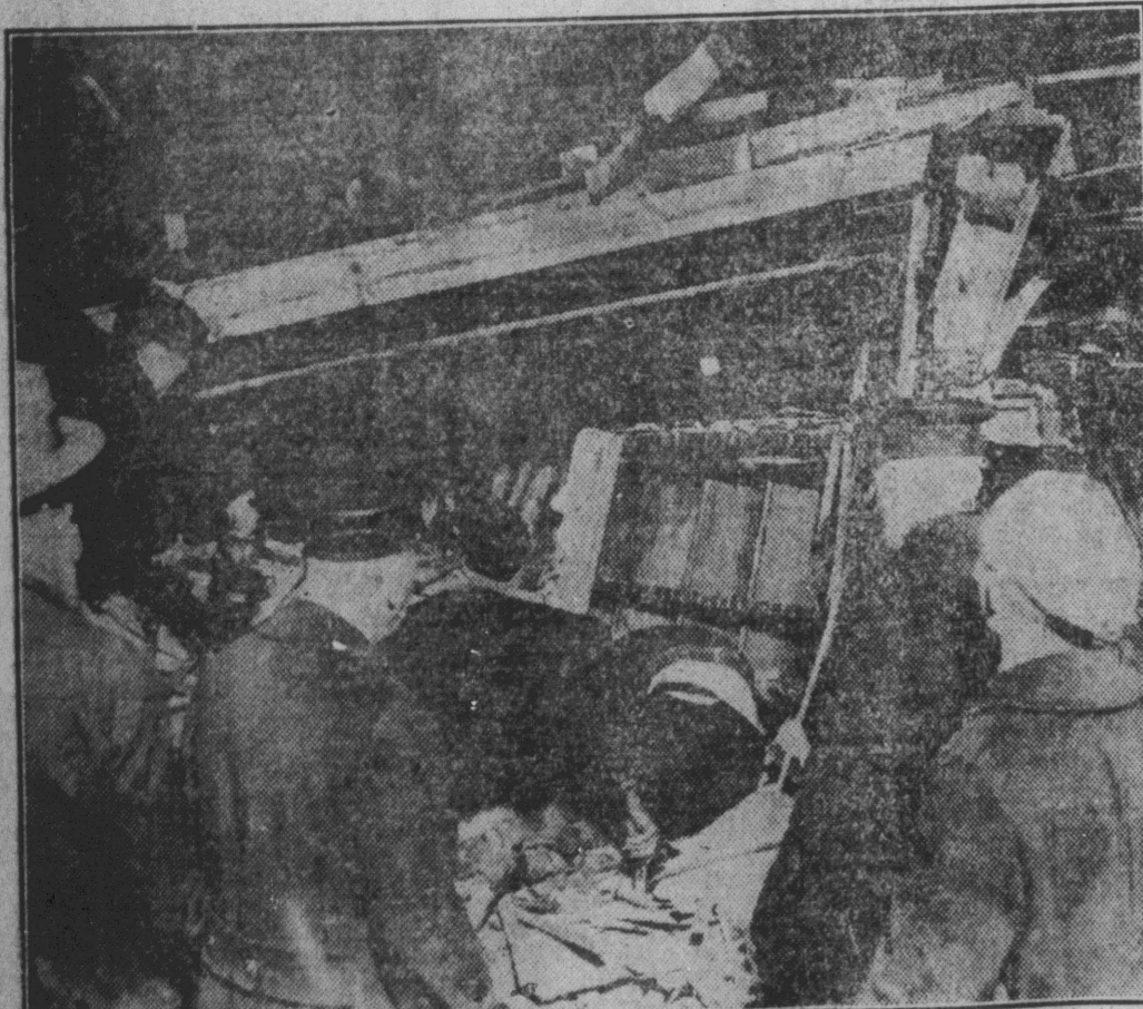
After toying with communities in northern Arkansas and southeastern Missouri, a tornado tore with all its fury from one end of Tennessee to the other, leaving in its path 35 dead, about 400 injured and piles of wreckage that once were business houses and homes. This picture shows rescuers searching a demolished home in East Nashville where they found a woman dead and her son injured.