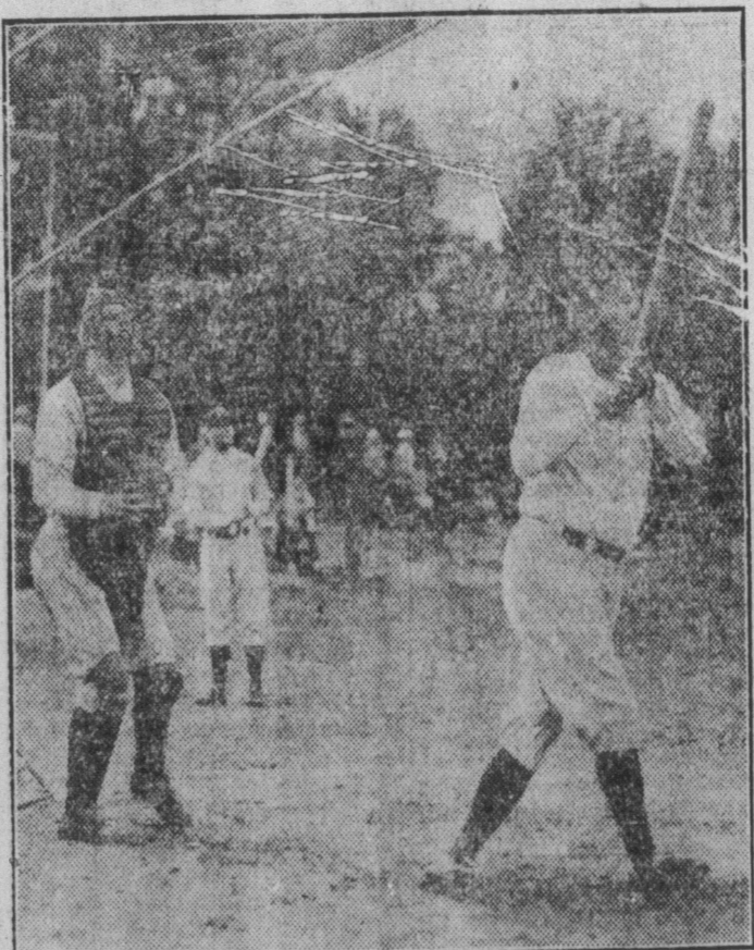
Though still outside the fold, Babe Ruth has been working out with the New York Yankees at St. Petersburg, Fla., pending the arrival of Col. Jacob Ruppert and a conference over the $50,000 contract he has declined to sign. He is shown here as he took a sturdy swing at the ball.