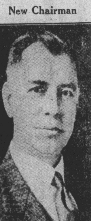
Senator Key Pittman of Nevada is the new chairman of the senate foreign relations committee.

Washington, D. C., March 17.—(AP)—House Democratic leaders decided today to send the beer legislation to conference with the Senate to adjust differences existing between the two branches on the alcoholic content. The House bill having allowed 3.2 per cent and the Senate limiting it to 3.5 per cent.