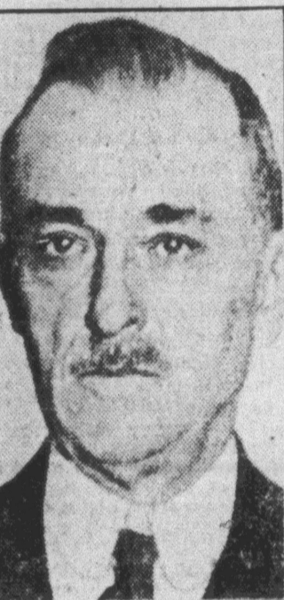
Fred I. Kent, New York investment banker, was named by the Federal Reserve bank as "dictator" of foreign exchange to regulate future transactions and restrain speculation in the dollar.