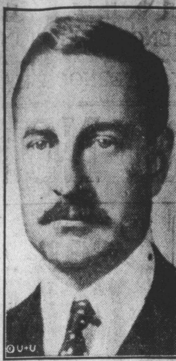
Winthrop W. Aldrich, head of the Chase National bank of New York, proposed the most drastic program of banking reform that has ever emanated from Wall Street. The plan would divorce deposit and investment banking completely.

dition has given it additional value. Gold Measures Money Gold is simply a measuring unit for money, just as a yard is a measuring unit for distance. A dollar—defined always as equal to 23.22 grains old pure gold—may buy more in one year than in another.