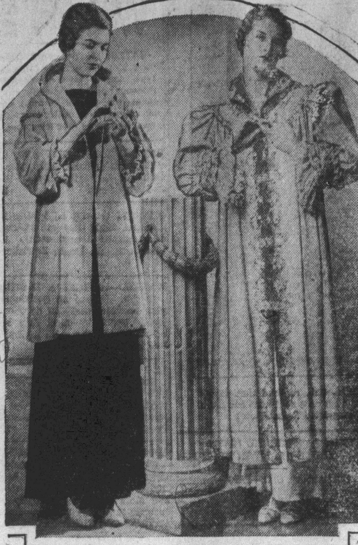
Shown at the right is a wrap made and worn in the gay nineties. The other is its 1933 lineal descendant. The modern interpretation, in the beige tone of the original, is an adaptation consistent with the mauve decade trend of fashion.