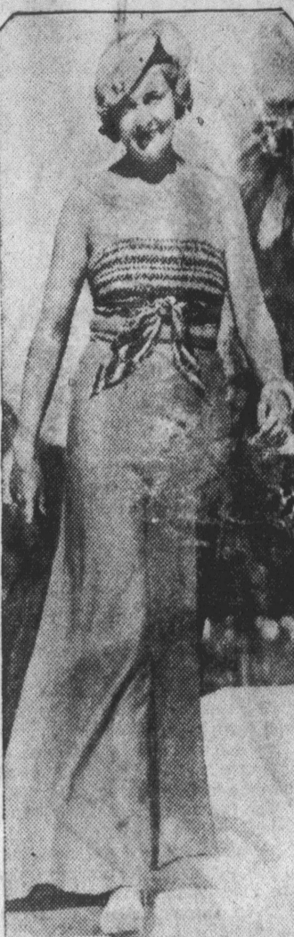
An unusual bodice and transparent trousers combine to make this beach ensemble a little different. Picture was made at Miami Beach, Fla.