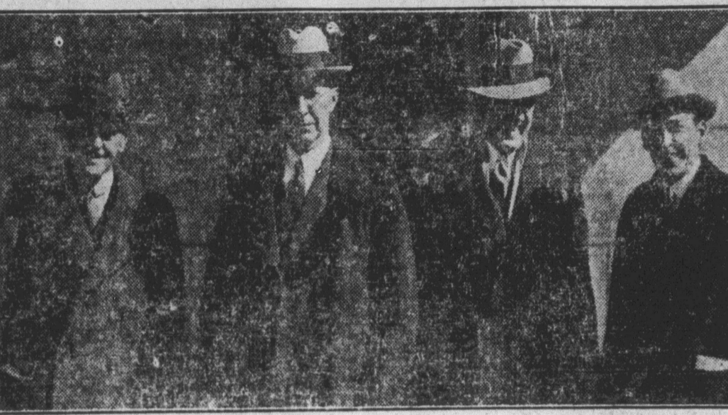
The new secretary of the treasury, William H. Woodin, lost no time getting to work on the banking situation. He is shown outside the treasury building after a conference at which the present crisis was discussed.