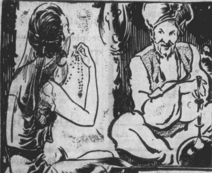
"A little you weary me," said the Kaid.

The Kaid Abd'Allah Karim, seated upon his cushions in the Lady Zainub's chamber, laughed merrily his famous laugh, that hearty, deep-throated laugh, which shook him from head to foot, and checked so rarely inspired a sense of amusement and inclination to laughter in the hearer.