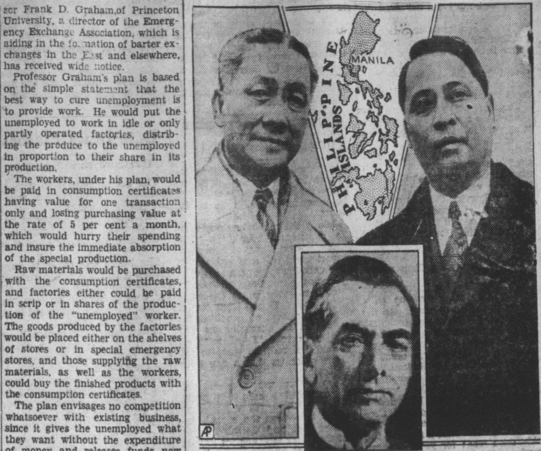
Manuel Quezon (below), veteran Filipino politician, is coming to the United States to satisfy himself that the new law for Philippine independence is the best that could be obtained by the island commissioners headed by Sergio Osmena (upper left) and Manuel Roxas.

Manila.—(AP)—Facing a momentous issue in the acceptance or rejection of the Hawes-Cutting independence bill, the Philippines are watching closely the maneuverings of their political leaders.