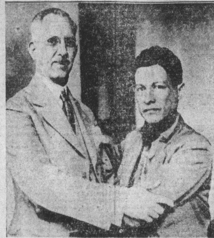
With the request, "Let us embrace, we are brothers," Gen. Augusto Sandino (right) made a surprise visit to Managua, capital of Nicaragua, to discuss peace with President Juan B. Sacasa. The sudden promise of peace came after years of fighting between Sandino's forces and the Nicaraguan government and U. S. marines.