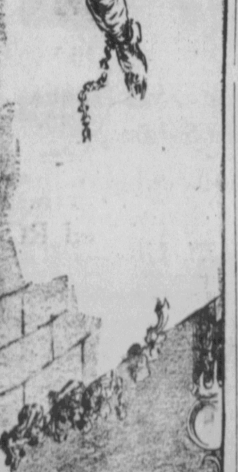
"Chucked off a tower."

"Ho, jus, before and behind. I didn't stay before that I'd bin 'ere before, but we come home some