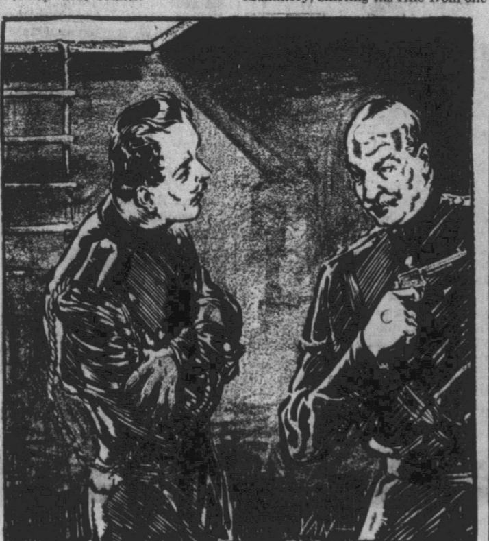
Le Sage would grin—and pull the trigger.

Chapter 4 "FORWARD, MARCH!" "Een avant! Marche!" And once more the little column staggers forward, Major Riccoli rides to his place at its head, thrusts his right hand inside his cloak and broods Napoleonically. Napoleon the Fourth? But why be Fourth to anybody? Why not Riccoli the First or perhaps just Napoleon Riccoli, like Gustavus Adolphus, Ghengis Kahn or Attila the Hun. But, after all, the world would choose for itself. These names are given, not chosen. It would be for History to name him Napoleon the Fourth, Riccoli the Redeemer—or just plain simple Napoleon Riccoli like plain simple Julius Caesar—greatness unadorned. Meanwhile the first step. It is the first step that counts.