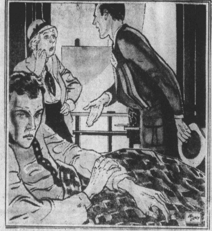
"Marriage with Barbara would be advantageous to Mark."

"It's all very well for Mark to tell me to shut up!" thrust in Mrs. Lodely. "But I don't see why I shouldn't say I never heard anything so fantastic in all my life. And you can't deny that I warned you, Farrell, didn't I? I said Babs has never had a thought apart from me, Mark. But I daresay you're one of the