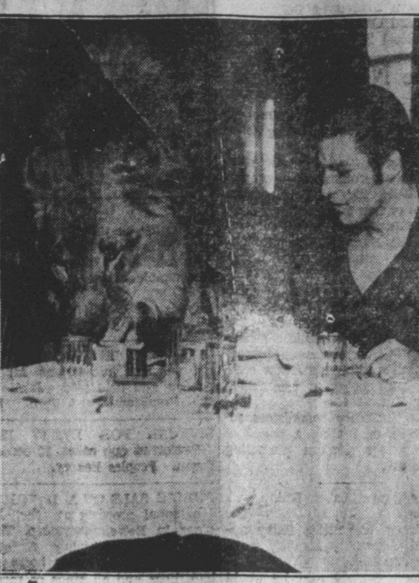
When the noon whistle blew on a Hollywood movie lot, Buster Crabbe, Olympic swimming champ, had for his luncheon guest "Gentleman Jackie", famous trained lion. Jackie's table manners seem to be above reproach.

ton, the Democratic leader of the House, Representative Rainey, predicted there would be "no reduction" of the debts and that the conference "won't amount to anything."