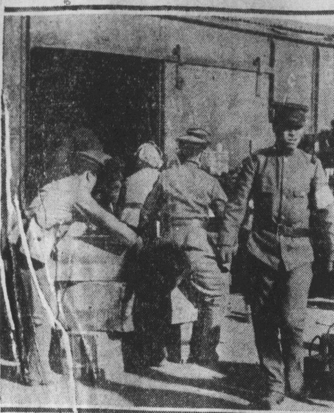
Japanese soldiers at Chinchow, Manchurian headquarters of the eighth division, are shown loading shells and machine gun ammunition on a train bound for Changhaiwan in north China where the Japanese routed the Chinese defenders after heavy fighting and occupied the city.

the Leas had given up to Sheriff Peavyhouse. The latter was not in the county and could not be reached. Efforts to reach the Leas in Nashville today were fruitless.