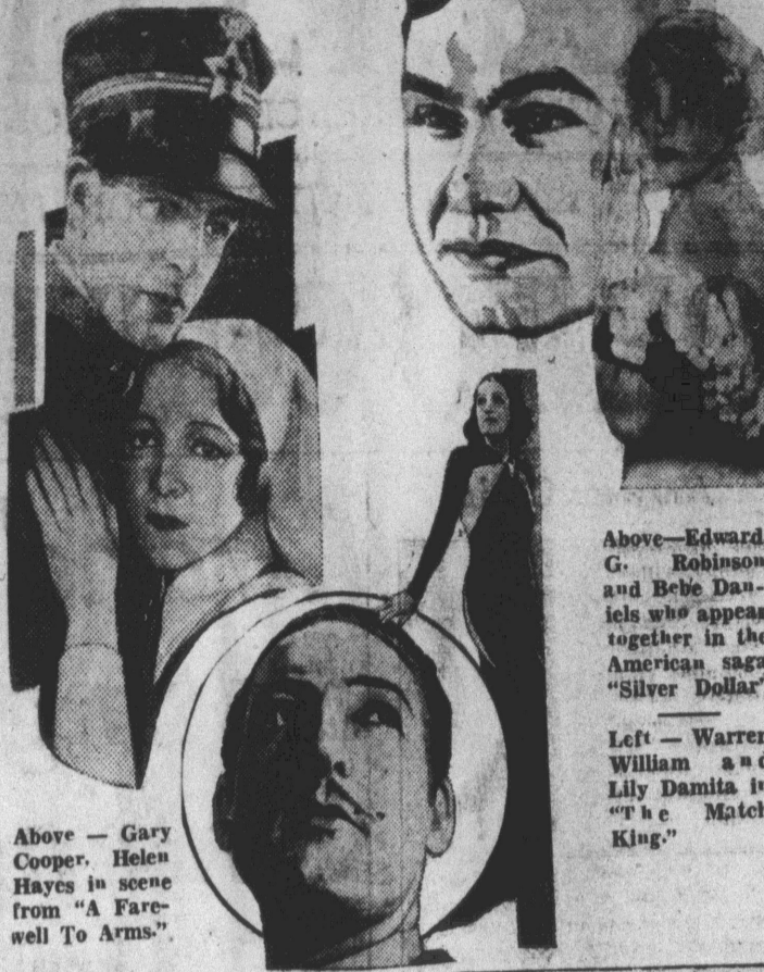
Above—Edward G. Robinson and Babe Daniels who appear together in the American saga "Silver Dollar"