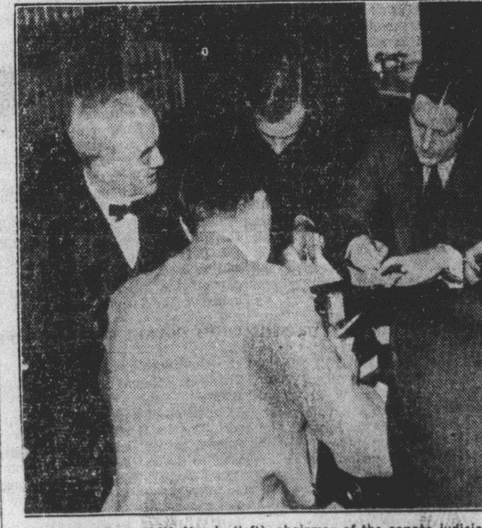
Senator George W. Norris (left), chairman of the senate judiciary committee, is shown telling newspapermen the results of the committee's vote on the senate's proposed repeal resolution. The committee recommended repeal of the eighteenth amendment along the lines set forth in the republican national platform. It met with strenuous objection among democratic leaders of the house.