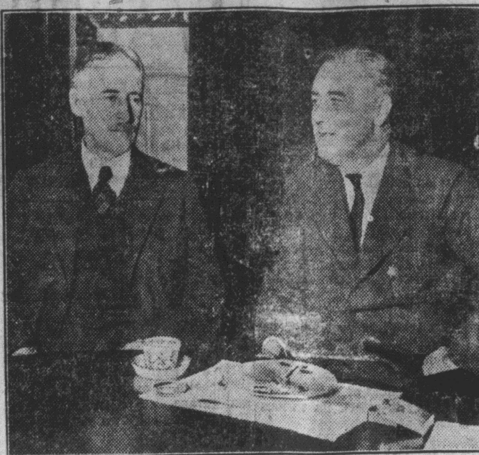
A picture of the complex international situation was painted for President-elect Roosevelt by Henry L. Stimson, secretary of state, in a lengthy conversation over the luncheon table at the Roosevelt estate near Hyde Park, N. Y.