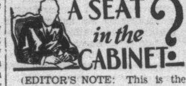
A SEAT in the CABINET

The Lodely dump another responsibility, tomorrow, on Barbara's willing shoulders.