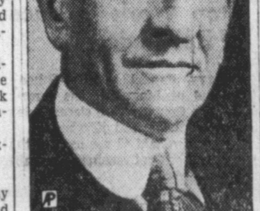
CARTER GLASS of Virginia

Woodrow Wilson called Carter Glass, of Virginia, from his seat in Congress to accept a Cabinet post as Secretary of the Treasury.