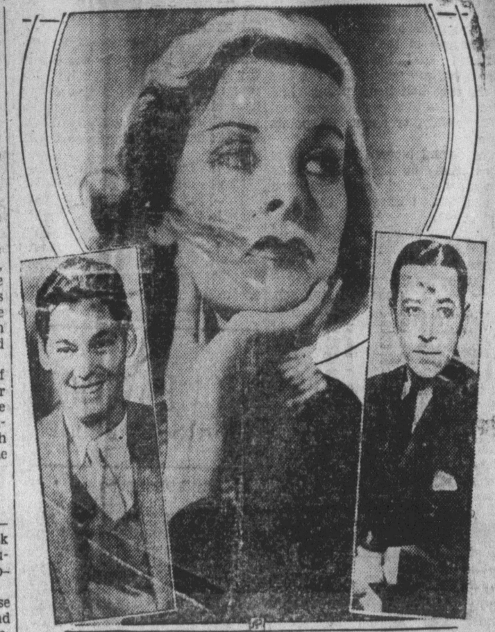
The year 1932 gave film fans a galaxy of new stars, Katharine Hepburn looming among the brightest. Shown above, she became the talk of movie critics after her first film, George Raft (right) and Joanny Weissmuller (left) are among others who stood out in the year's films.