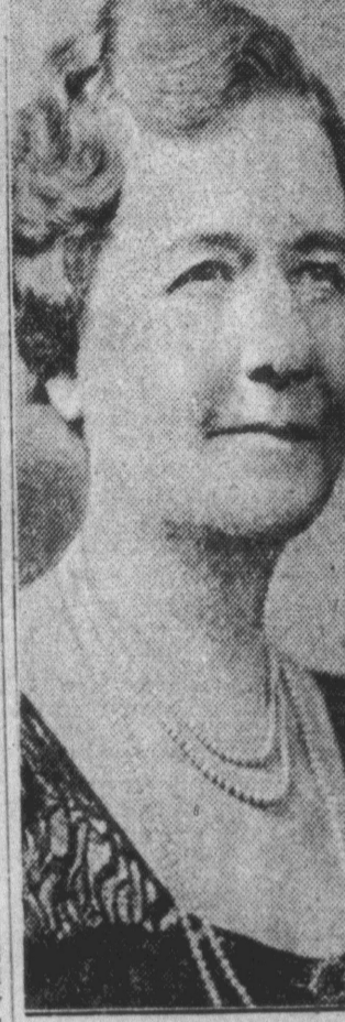
Despite a previous announcement that the John N. Garners would accept only "official" invitations, Mrs. Garner gave society-loving Washington some cheer by saying she is giving serious study to her oncoming social role as vice-presidential hostess.