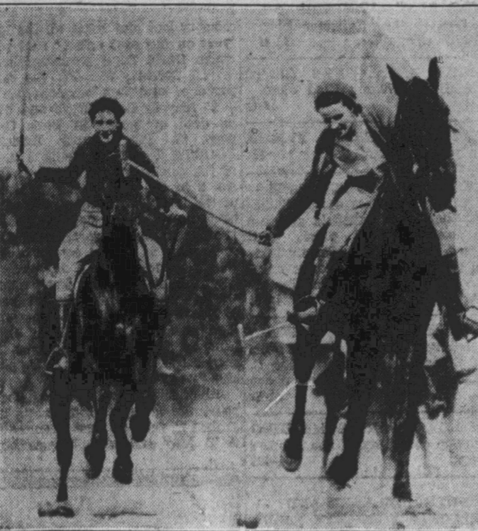
Co-eds at the state college, San Diego, Cal., have formed a polo team which plays several days a week after classes. After an hour of such hard riding as is shown in this shot, the equestriennes are ready for a late afternoon "spot of tea."