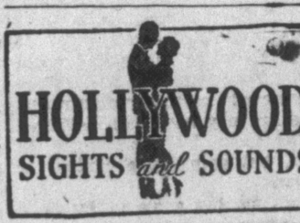
By ROBBIN COONS - Hollywood, Calif., Nov. 22.—There are some expensive faces on the cutting room floor these days, perhaps the natural outcome of the desire to put "name players" even in minor roles in pictures.