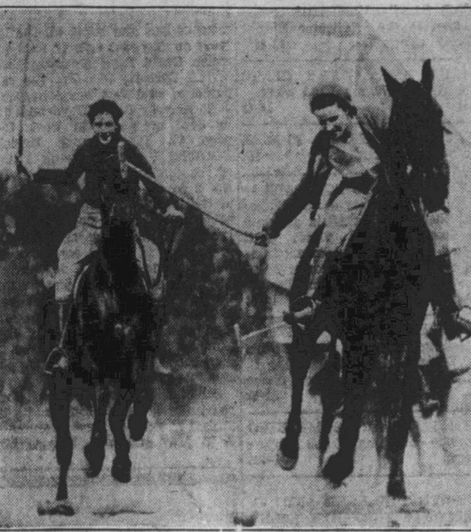
Co-eds at the state college, San Diego, Cal., have formed a polo team which plays several days a week after classes.