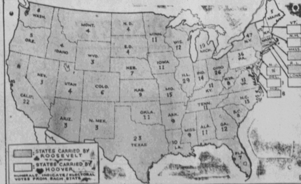
Above map shows how the states voted in national election. Numerals indicate the electoral votes. The states in the Hogver column were Maine, New Hampshire, Vermont, Connecticut, Pennsylvania and Delaware. The electoral vote was Roosevelt 472 and Hoover 59.