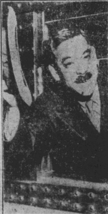
Yocuko Matsuoka will be Japan's spokesman at the League of Nations assembly's special meeting in Geneva to discuss the Lytton report.