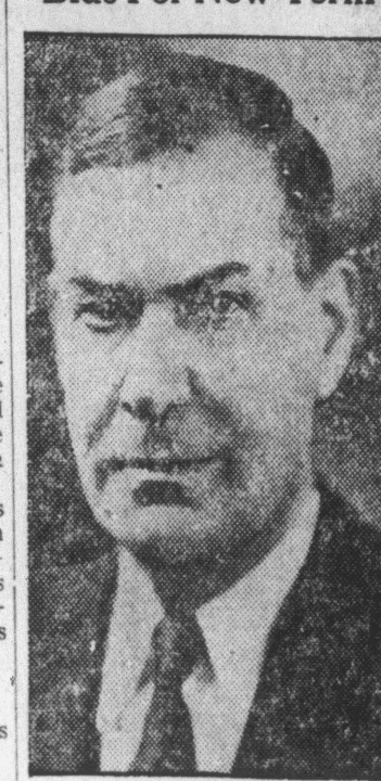
Wesley L. Jones, veteran republican senator from Washington, is a candidate for reelection.