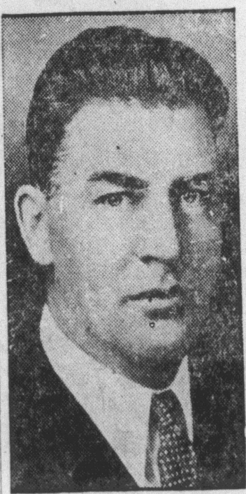
Lieut. Gov. Edwin C. Johnson (above) of Colorado, who was private secretary to Governor Adams, is a democratic candidate to succeed his chief as governor of Colorado.