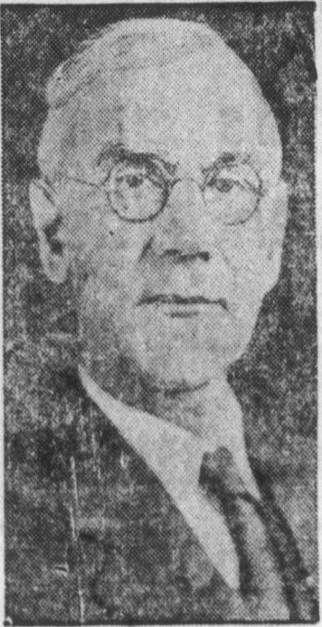
Reed Smoot, veteran republican senator, is seeking reelection in Utah.