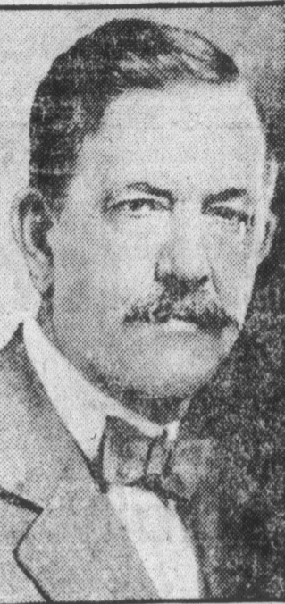
Senator E. D. Smith is the democratic candidate for reelection in South Carolina.