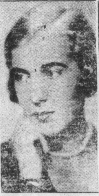
Rumors that the engagement of Princess Ingrid, 22, of Sweden to Prince George of the Prince of Wales will be announced in London on November 11 were openly discussed in Stockholm newspapers.