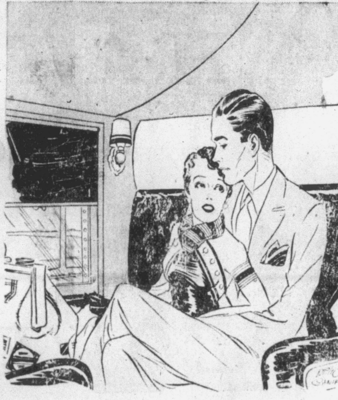
"Married again. I adore it."

How much longer would she be able to hold out against him? The only reason he didn't intrude in person was that she'd left strict orders at the desk. For weeks she'd