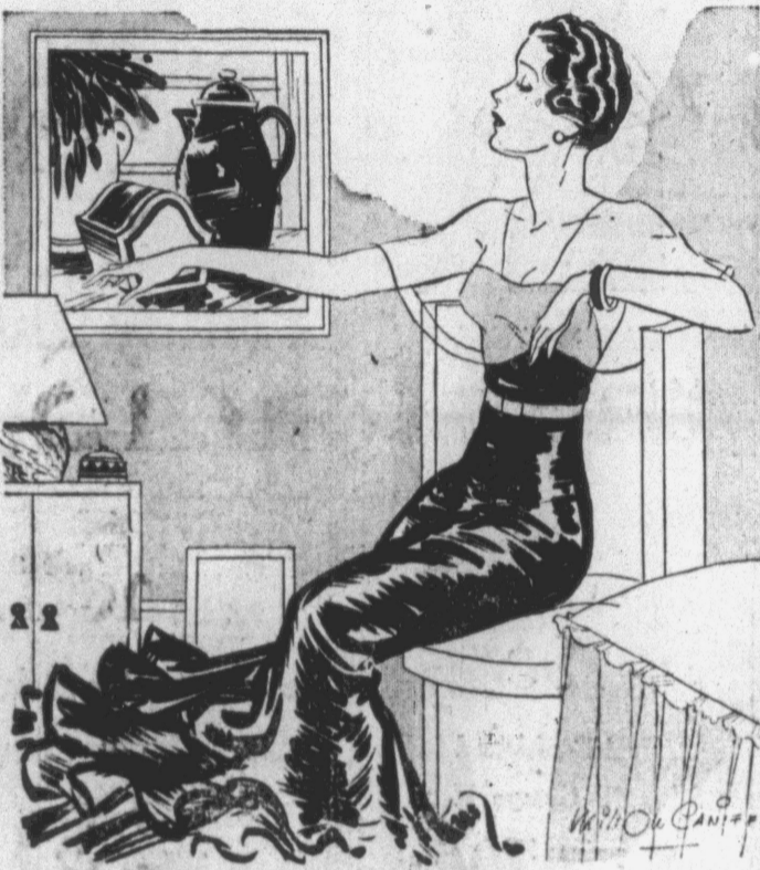
Santa rehearsed her new part like an actress.

gate to open and was among the first to scramble aboard the train, nor did she feel safe till the wheels until next morning. Now Santa's were turning.