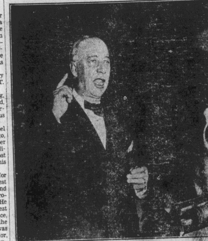
Before a capacity crowd of cheering, flag-waving men and women, Alfred E. Smith opened his speaking campaign in behalf of the Roosevelt-Garner ticket in the state army at Newark, N. J. The "happy warrior" of 1928 was the center of one of the most enthusiastic political rallies New Jersey has ever known.