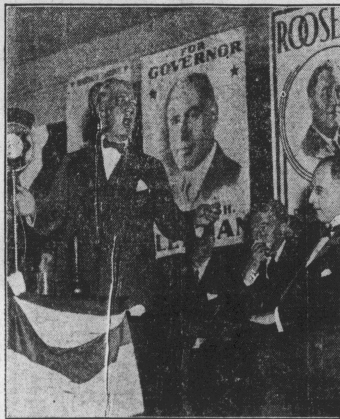
Alfred E. Smith, taking an active part in the campaign for the first time, called for the election of the democratic national ticket at a political rally in Tammany Hall, New York.