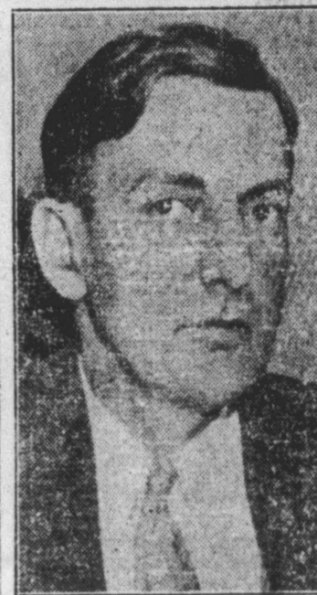
James E. Stewart (above), federal operative of the United States senate banking and currency committee, has begun an investigation of the Insull financial collapse.