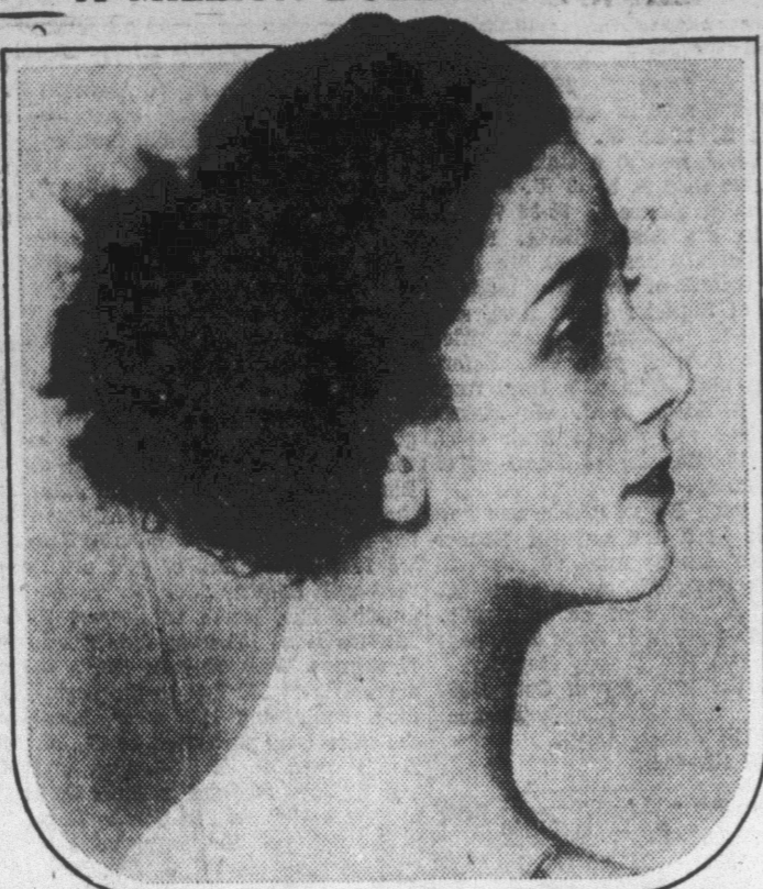
This likeness of Yolanda Pereira will appear on the new issue of Brazilian silver money. The Brazilian beauty was voted "Miss Universe" at the 1930 beauty contest in Rio de Janeiro.