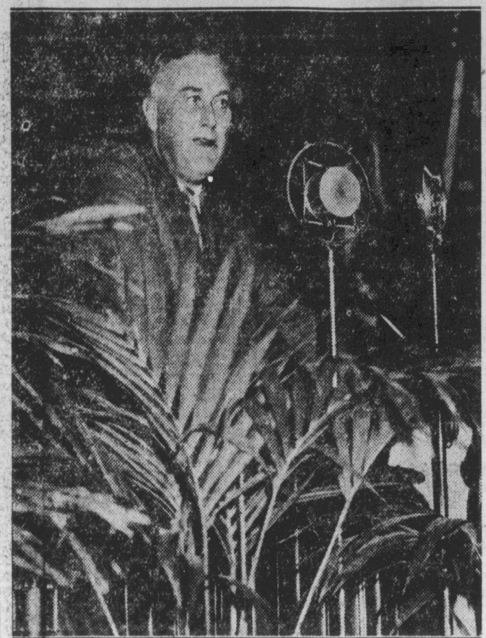
Governor Roosevelt delivered the first address of his second major campaign tour in Rochester, N. Y. He is shown speaking in the Rochester convention hall.