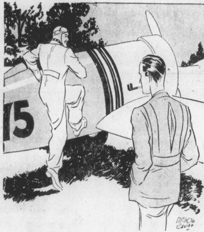
Mr. Dawn shouted: "Not a bad landing." Clive went forward.

"What you're really asking me to do is to hold your hand and leap with you over a precipice," Santa said.