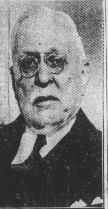
Police in Lisbon, Portugal, were ordered to arrest Samuel Insull, who was reported en route to that city from Paris where this picture was made. He was recently indicted in Chicago on charges of larceny and embezzlement.