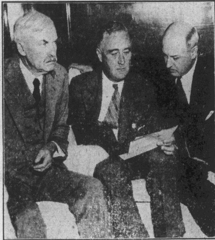
Gov. Franklin D. Roosevelt, the democratic standard bearer, is shown conferring with Senator James A. Farley (right), chairman of the democratic national committee, aboard his special train as he passed through Montana enroute to the Pacific northwest.