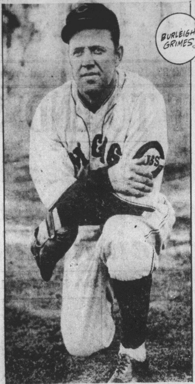
Burleigh Grimes, veteran spit ball artist who helped put the Cards over in the last world's series, appears this year with the Chicago Cubs in the old struggle with the New York Yankees. Sickness has taken the edge of Grimes' hurling skill but he's expecting to get in a few gas during the series battles.