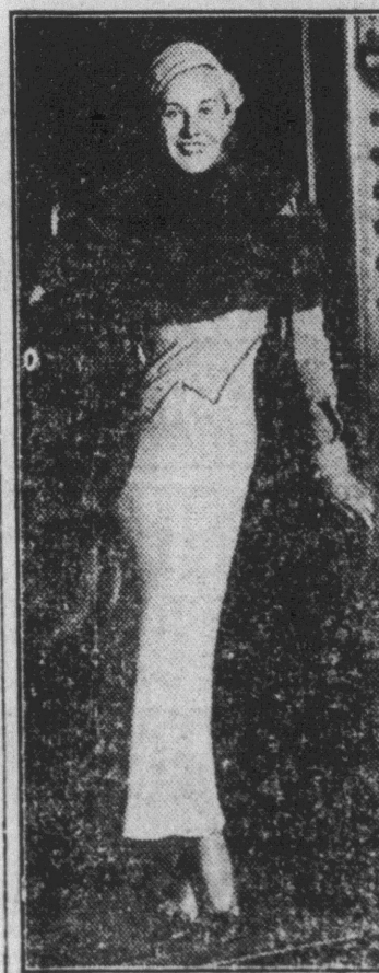
Pauline Goddard, chief movier of town, didn't say "yes" and she didn't say "no" when asked upon her arrival in New York whether she was engaged to marry a man in whose name she wears a hat.