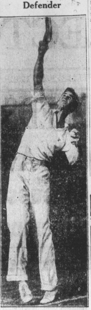
Ellsworth Vines, young California net ace, shown in action at Forest Hills, N. Y., as he breezed through a match in defense of his national singles title. In spite of the mighty French entry, Henri Cochet, he loomed as the favorite to retain the crown.