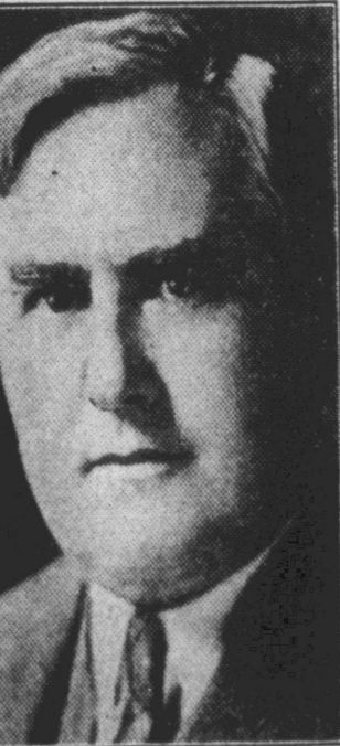
Rep. Augustine Lonergan was nominated by Connecticut democrats for United States senator at the party's state convention in Eastern Point.